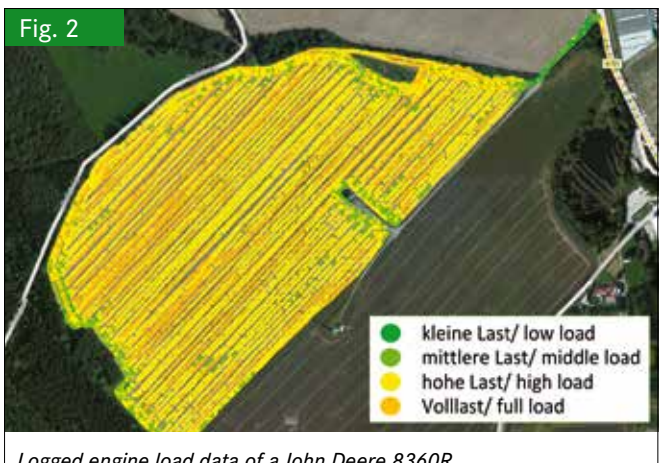
Logged engine load data of a John Deere 8360R

The field tests have been executed in April 2014 on a midsized farm in Saxony. One focus during these tests was the implementation and validation of an automatic condition monitoring. As an example a function that classifies the load in different states has been developed according to von Toll [5]. The source signal for the function is the engine load in percent from the standard of SAE J1939 [4]. The engine load signal is available on almost every examined machine. The following load states have been created within the configuration tool (Table 1). Subsequently, the created configuration file was transferred to the Agro-MICoS box. The box was mounted at a John Deere 8360R. The log files were transmitted via GSM to a server and afterwards copied into the data server of our project partner Agri Con in order to visualise the results (Figure 2).