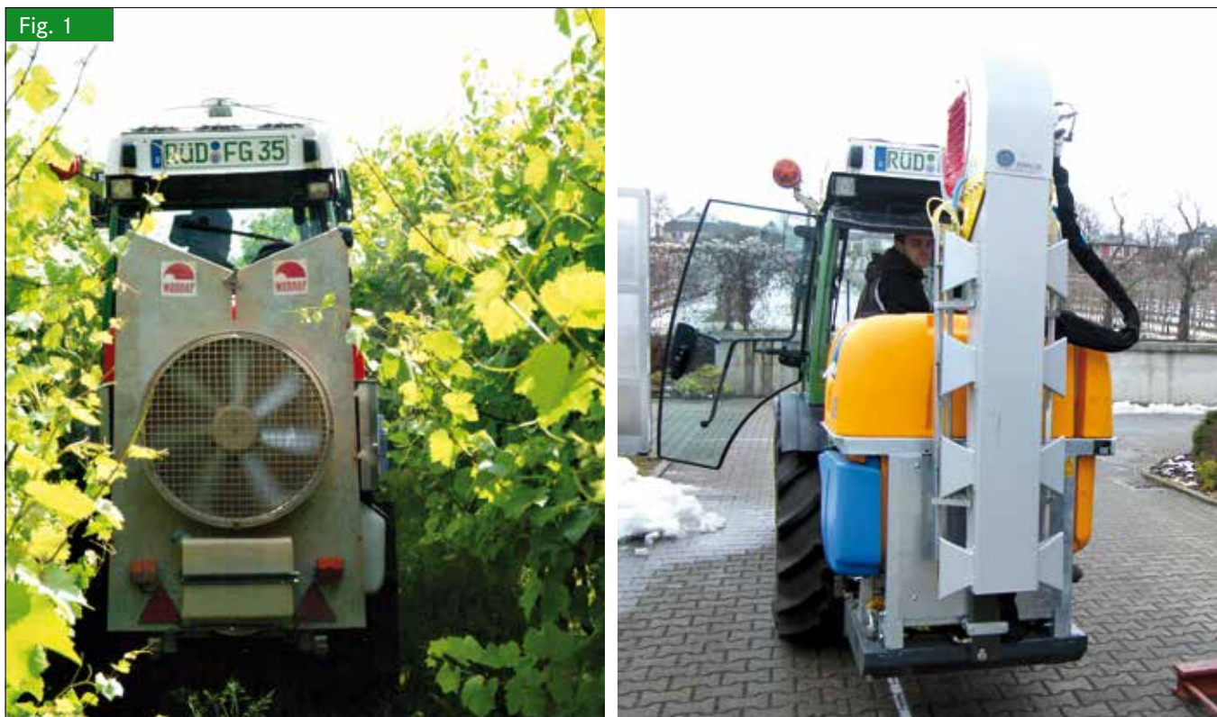
Fig. 1 Sprayers in the trial for measuring leaf deposits in minimum pruning system. Left: Wanner SZA 24 axial fan, right: Rinklin radial fan

The method described can already be found in the applicable literature with regard to leaf deposit measurements in espalier vineyards [4; 5; 6]. In order to meet the special challenge of spraying minimum pruned system vines, the respective sampling method was modified so that it was limited to three areas specific to minimum pruning. The height of the foliage wall at vine stage BBCH 75 was 250 cm above the ground on the sampling day whereby the bottom of the foliage was 70 cm above ground. The breadth of the foliage wall in the expansive areas reached from 160 to 170 cm. With minimum pruning, there is no localisation of the grape zone, this being spread over the entire foliage wall including the canopy roof of the foliage bell form. The three sampling zones were accordingly established as ( Figure 2 ):