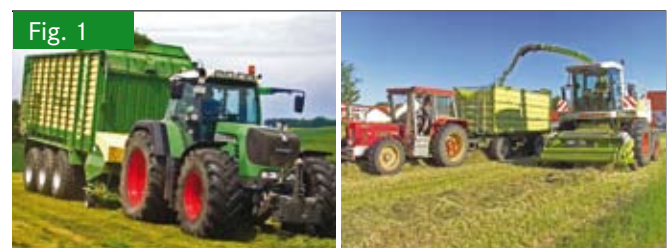
Fig. 1 The grass silage preparation with the load carriage (left) and in the harvesting chain

Silage preparation on farm B goes on with a 225 kW-tractor with 43 m 3 forage wagon. The mower before harvesting is a self-propelled mower with 9,7 meters working width, conditioner and a power of 260 kW.