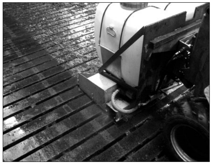
Fig. 2: With the Cleanmeleon 3 (gold medal winner) Westermann presents a modular slat cleaner which effectively cleans both surfaces and interstices. (Gold medal)

For a long time liquid manure spreading equipment represented the weak point in the whole process. This has changed now with application systems that are very precise,