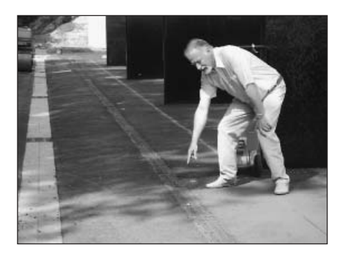
Fig. 2: Arrangement of concrete slit and drain trench

Here, though, it is essential, that the valid and continually improved "Construction rules" be observed and implemented. Selfmade "chicken manure concrete" cannot ful-