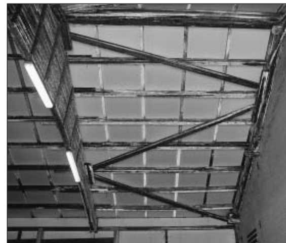
Fig. 4: Mould in a potato store. When this point is reached, demolition is unavoidable.