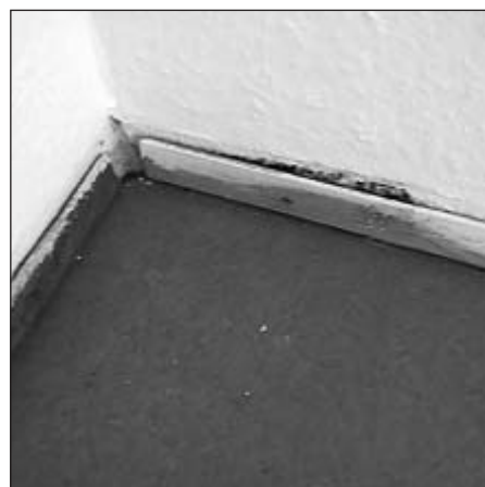
Fig. 2: Mould fungi behind the base board in the living area