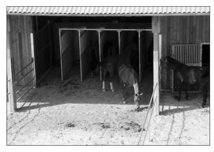
Fig. 2: Defecation behaviour in frontage of outside pen here in front of the feeding stations

rison possible between individual and group husbandry systems in combination with outside pens for six large horses. Thus, impacts of the husbandry system or their constructional designs could simultaneously be tested for their impact on animals and environment.