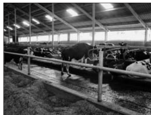
Fig. 1: Modern outside climate house with eaves ridge and cross ventilation, automatic manure removal with scraper, feeding as TMR

gran particle model in connection with a wind field model were carried out as well. After the draft of the VDI guideline 3473 „Reduction of Emissions from Animal Housing – Cattle“ (which was later withdrawn), had been published, this draft was used as a „source of information“ by the approving authorities. The same has so far applied to the VDI draft guideline 3474 „Reduction of Emissions from Animal Housing – Odorants“.