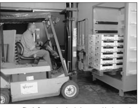
Fig. 2: Sweet cherries being stored in the newly developed conditioner for an experiment

When a coolroom is being emptied, vapour very often condenses on the cold fruit surface. This moisture can have a negative effect on the further keepability and is therefore not wished by producers and dealers [1, 4]. This negative effect is reduced through a rapid reduction of the condensate through applying warm air to the cherries.