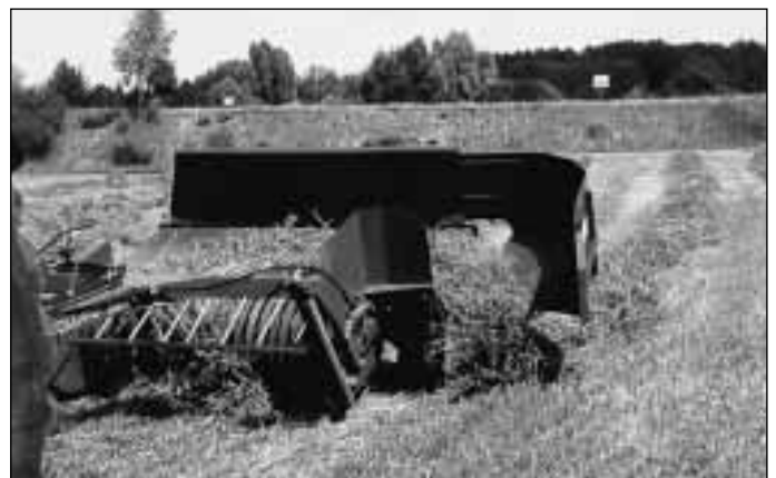
Fig. 1: Windrow inverter: system New Holland

First trials with this windrow inverter indicated that it cannot be applied directly for use under Bavarian conditions. Because of the small field structures and the associated frequent turning manoeuvres the manual lifting of the pick-up did not meet the practical