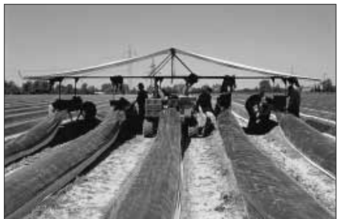
Fig. 1: 5-row harvester for white asparagus