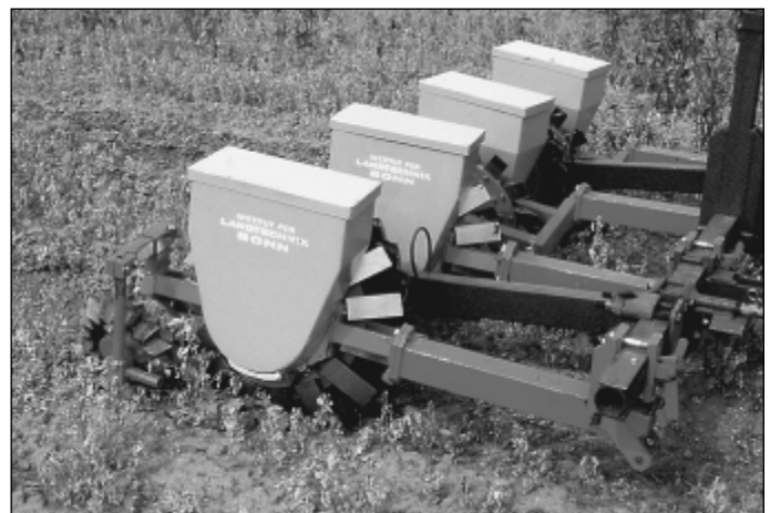
Fig. 1: Revolving spade planter

Revolving spade, punch planter, maize, field test, precision seeding